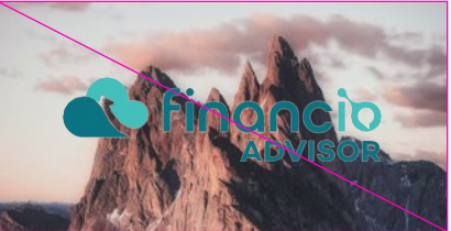
DO NOT place the Primary Positive brand mark on photography.